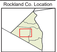
Map 1. Hydraulically isolated boundary and zone of influence of Production Well 55 source water used to identify customers notified of the MCL exceedance.